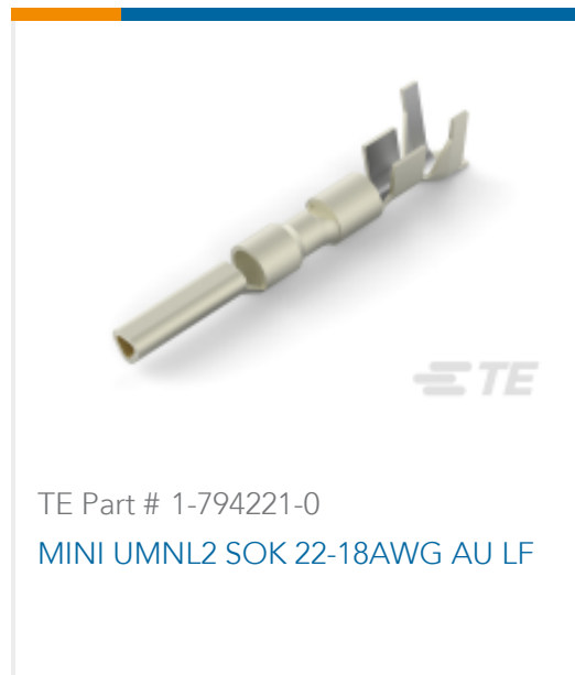
TE Part # 1-794221-0 MINI UMNL2 SOK 22-18AWG AU LF