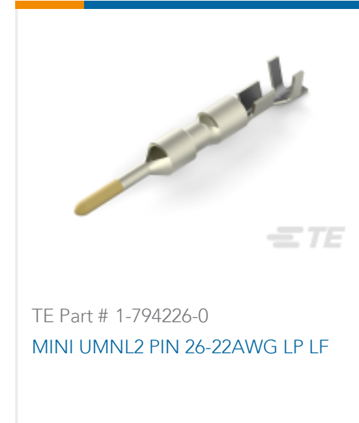
TE Part # 1-794226-0 MINI UMNL2 PIN 26-22AWG LP LF