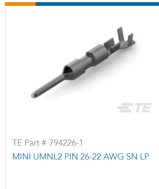
TE Part # 794226-1 MINI UMNL2 PIN 26-22 AWG SN LP