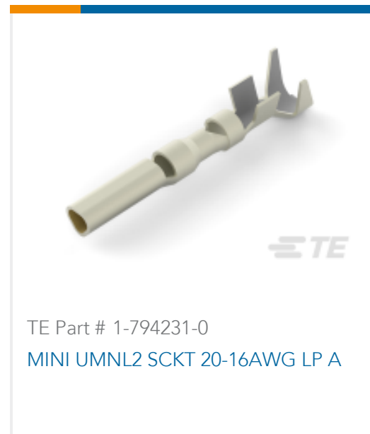
TE Part # 1-794231-0 MINI UMNL2 SCKT 20-16AWG LP A