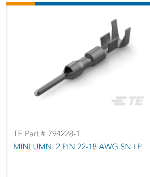
TE Part # 794228-1 MINI UMNL2 PIN 22-18 AWG SN LP