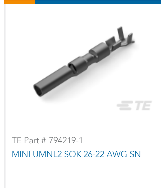
TE Part # 794219-1 MINI UMNL2 SOK 26-22 AWG SN