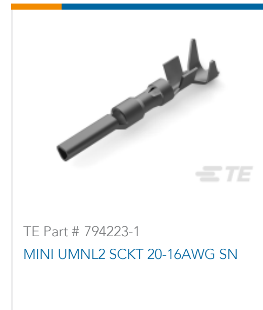
TE Part # 794223-1 MINI UMNL2 SCKT 20-16AWG SN