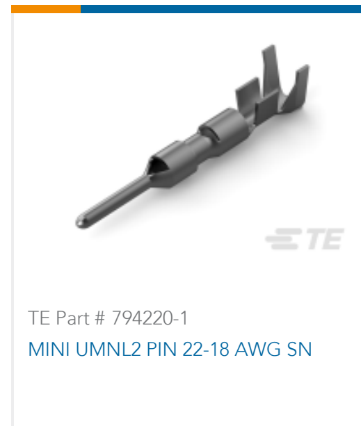
TE Part # 794220-1 MINI UMNL2 PIN 22-18 AWG SN