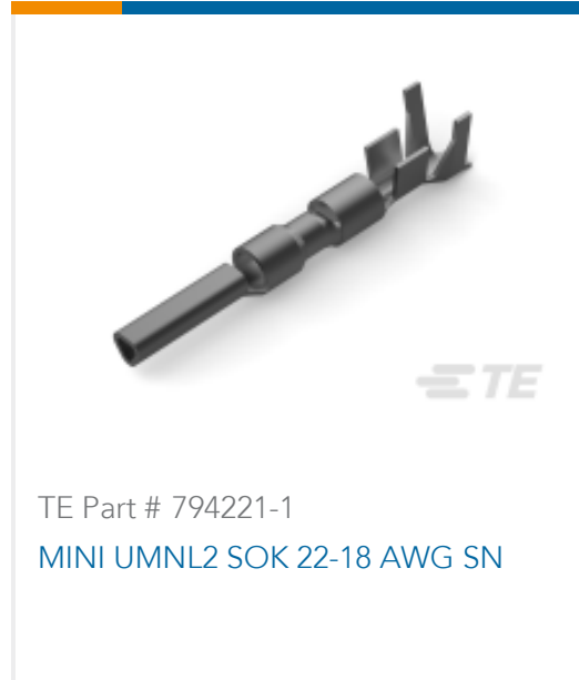
TE Part # 794221-1 MINI UMNL2 SOK 22-18 AWG SN