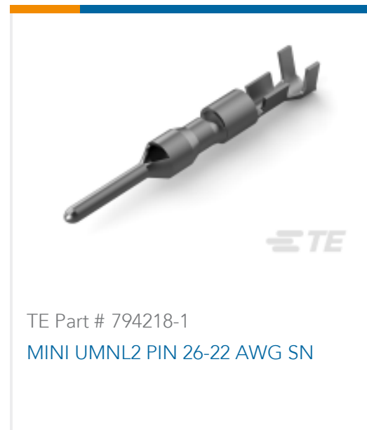
TE Part # 794218-1 MINI UMNL2 PIN 26-22 AWG SN