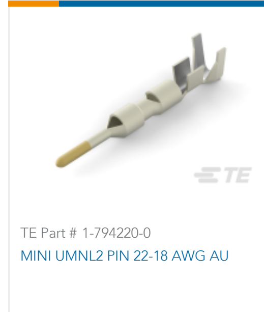
TE Part # 1-794220-0 MINI UMNL2 PIN 22-18 AWG AU