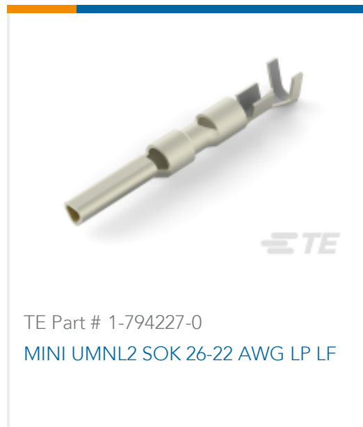
TE Part # 1-794227-0 MINI UMNL2 SOK 26-22 AWG LP LF